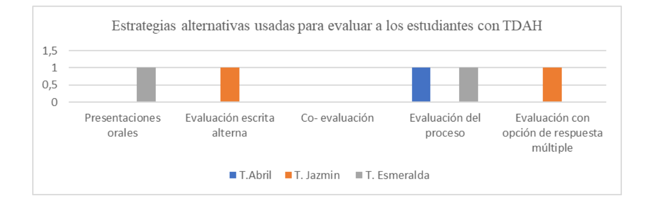
Figure 9 shows that in the alternative evaluation teacher Abril used the students'

Estrategias alternativas usadas para evaluar a los estudiantes con TDAH